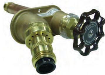
Model 25 With Single Check Vacuum Breaker